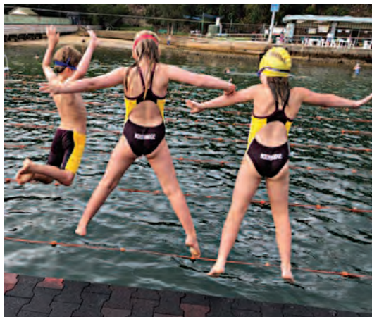
Swim club members having lots of fun at a typical Saturday morning meet

The NASC is having a terrific season, with an average attendance of more than 70 in recent weeks. Membership is again well above 120. NASC is a family club and the majority of our members are kids from three to 14. We start at 8am every Saturday for one and a half hours, with a varied and inclusive program and all are welcome.