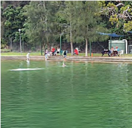
Visitors have been enjoying exceptional water clarity at The Baths

Summer has brought some of the most beautiful weather and tides enjoyed for years down at Northbridge Baths. Even the scattered storms and showers did not cause the seawater to lose its refreshing clarity – the clearest during summer in living memory.