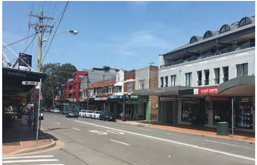
Current Sailors Bay Road streetscape